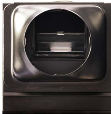
exhaust duct collar weighted backdraft damper recessed in duct collar

Abreezo is reintroducing the weighted back draft damper which is recessed inside the fan body collar. The weighted damper will provide less resistance during fan operation offering a more fluent air flow and quieter operation.