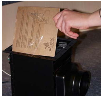
protective cardboard insert keeps debris out of the fan during construction

A new message has been put on the protective cardboard insert instructing the contractor to remove the cardboard and connect the Molex connector prior to placing the grill on the fan when construction and painting are complete.